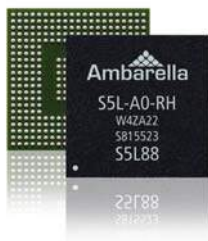
The S5L chip is suitable for professional IP Cameras with up to 4Kp30 video performance

The flexible S5L SDK provides a Linux-based framework and development environment that includes image-tuning tools and a rich set of APIs, enabling a range of product customization and differentiation options in areas such as sensor and lens tuning, analytics and network applications.